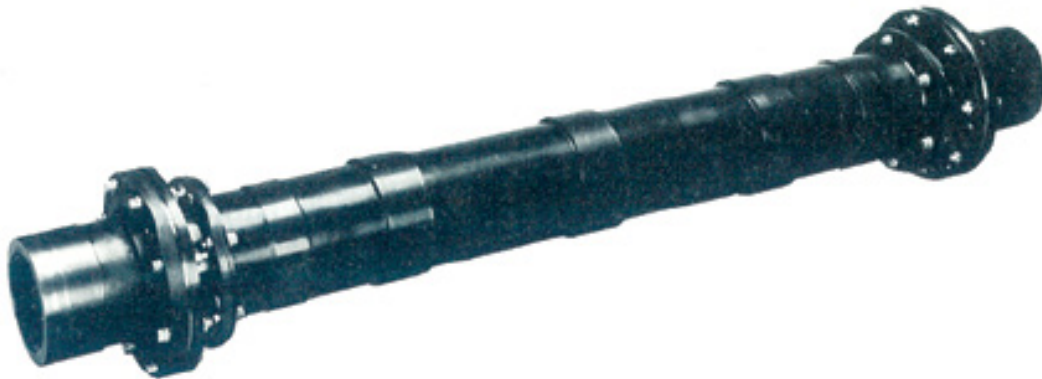
Built-in guards to the Ameriflex coupling are designed to protect adjoining equipment in the event of a shear failure.

taken for the additional benefit of each diaphragm being individually shot peened.